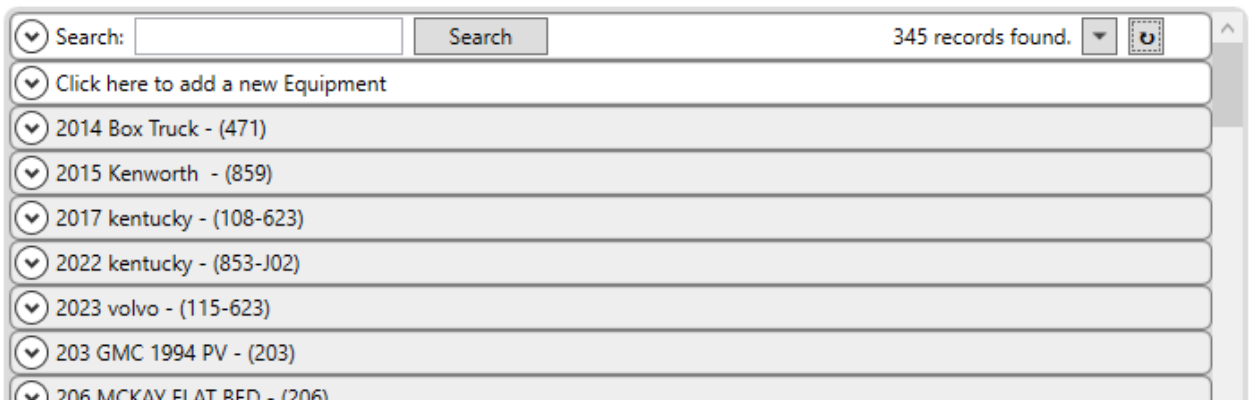
Figure 3: Equipment Setup after Refresh

When the save completes, the updated records are now sorted alphanumerically by the description.