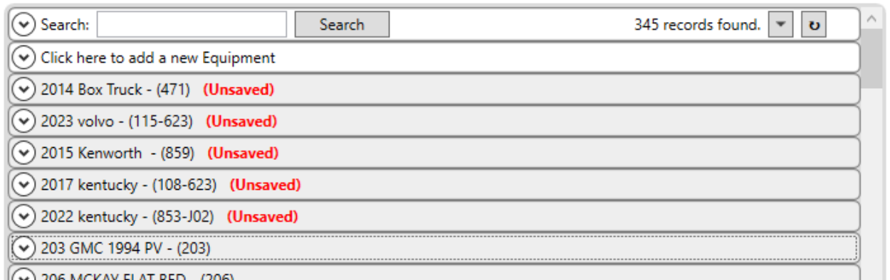
Figure 2: Equipment Setup with edited records

For example, if editing records within Equipment Setup and you press Refresh, the application will prompt you to save the changes and then update the sort to display according to the changes made.